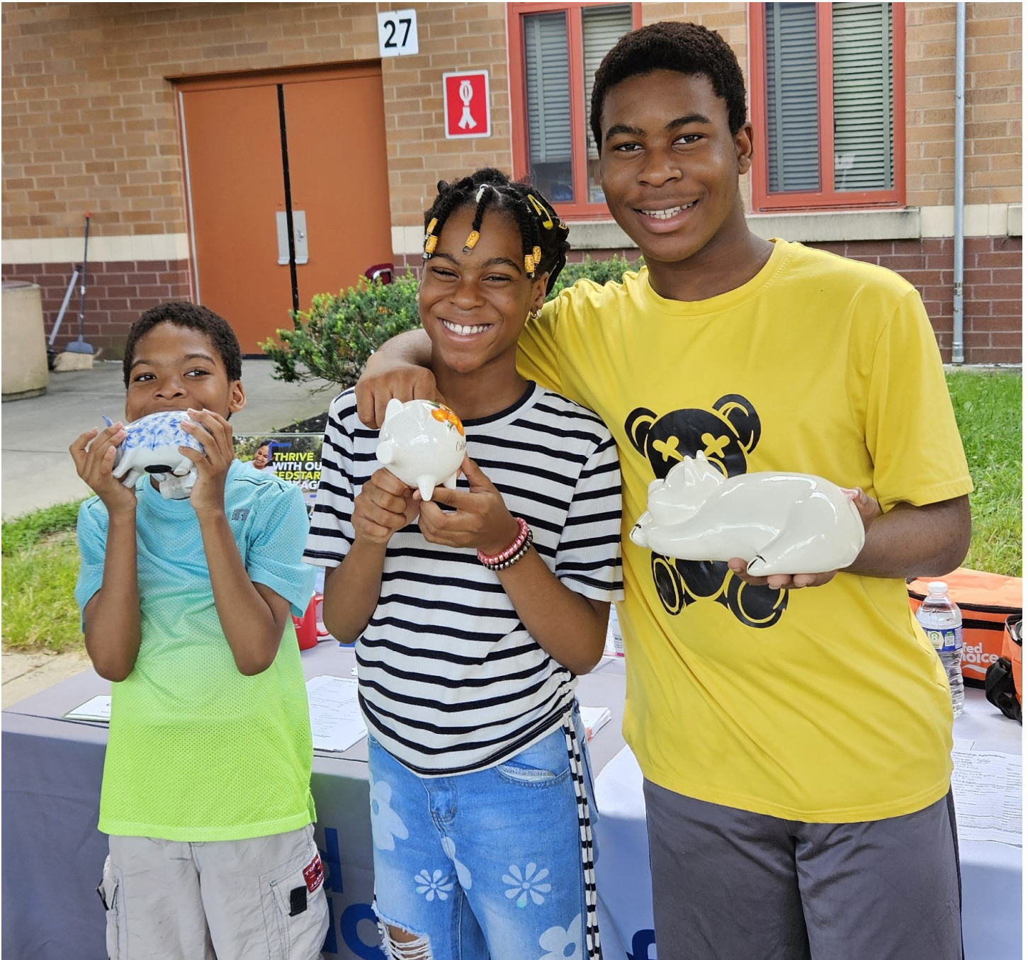
Local students showcase newly donated piggy banks and are ready to start saving at Annual Community Day at Cora L. Rice Elementary School @ FCF 2025