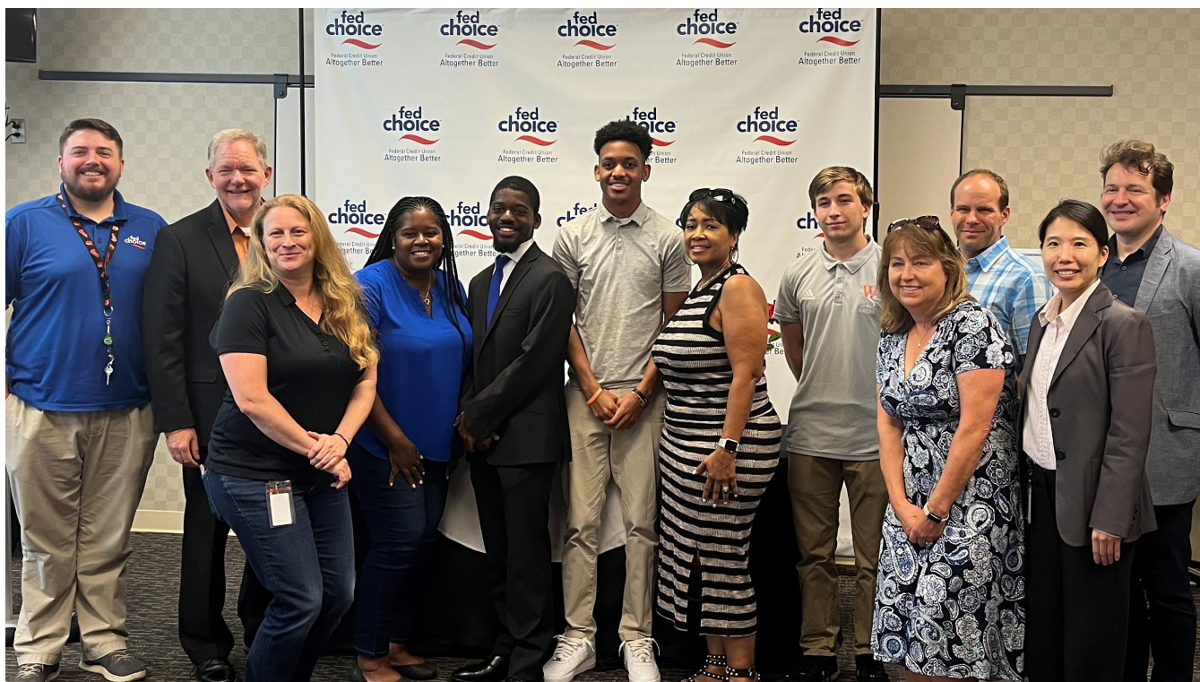
FEDCHOICE FCU AND FCF STAFF CELEBRATE WITH EDUCATIONAL SCHOLARSHIP WINNERS AND THEIR FAMILIES.

“Having financial freedom provides a sense of security and peace of mind. For many young people in our country, especially those in underserved communities, financial freedom can be a distant dream.”